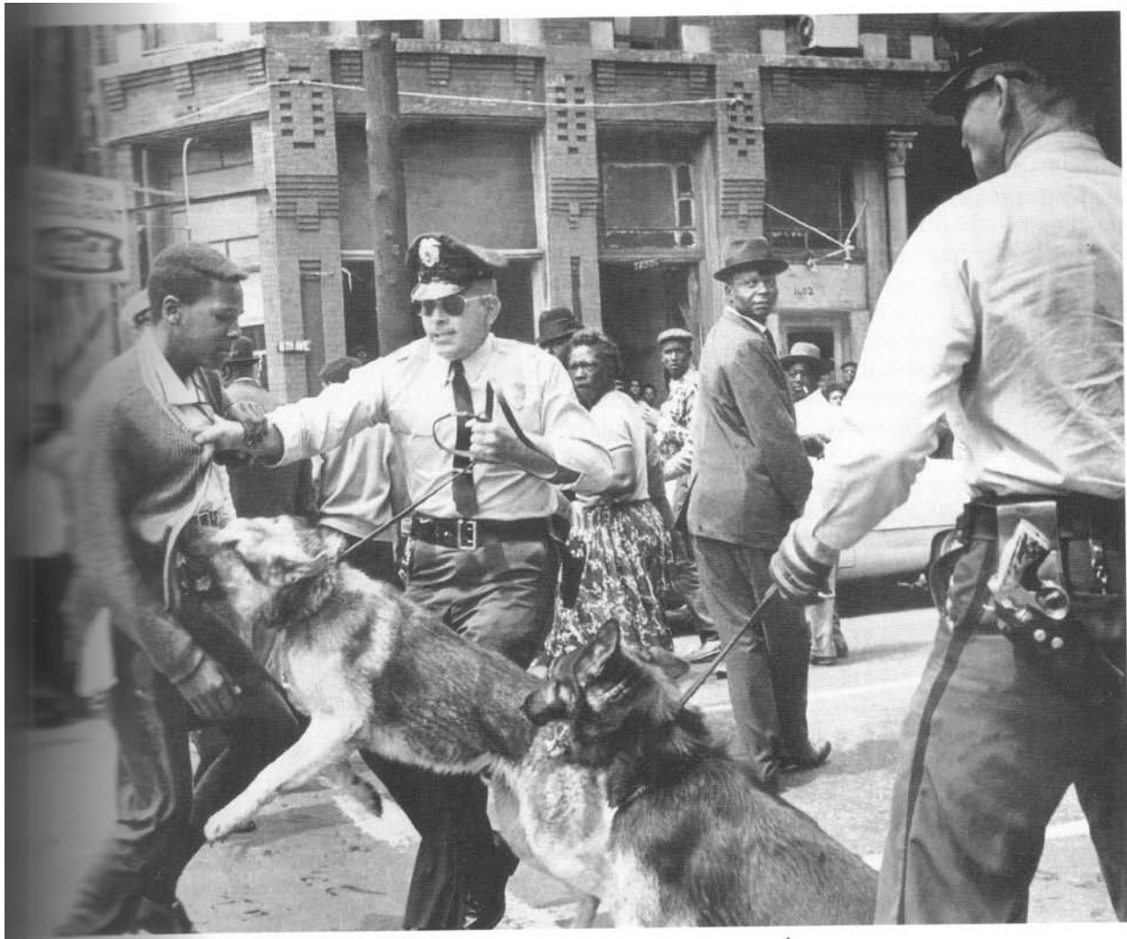
Source B “Children’s crusade” organized by SCLC Birmingham, Alabama, May 3, 1963